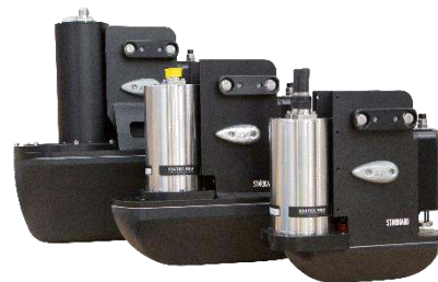
125 kHz, 250 kHz and 500 kHz transducers