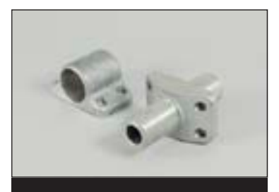
Mounting Brackets Attachments for the hydraulic haulers that enables universal positioning.