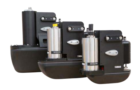
125 kHz, 250 kHz and 500 kHz transducers