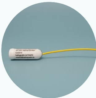
Optional spaghetti tag when implanted