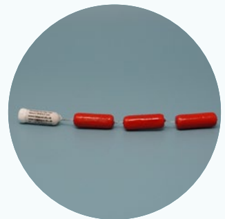
DST floats to increase recapture rate