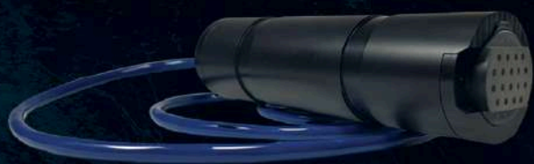
AQ5 5m rated

Profilers, Buoys, Vehicles, Moorings, River Stations, Sondes, Ferry boxes, Flow-through Systems & Flow Lines.